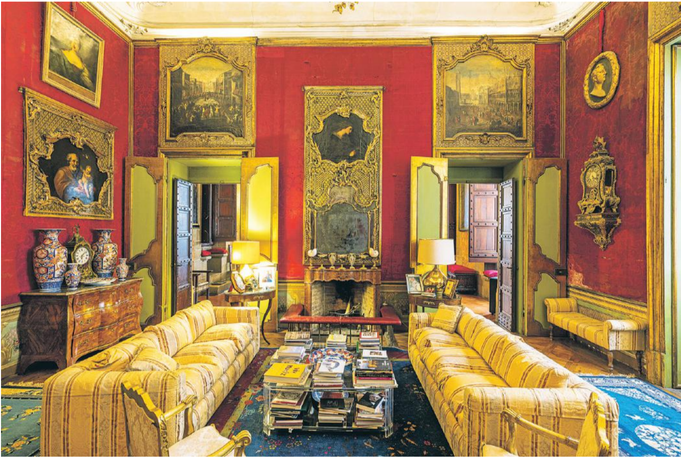
Top left, a view of the city from the palace tower; the ballroom, above, and grand salon, below; the red salon, left; and the library, bottom. The palace has always been in private hands.

The family hand-washed 2,500 chandelier crystals.